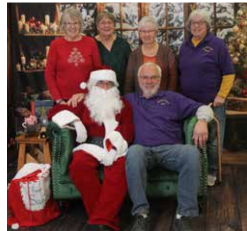
The Danube Lions served Juice and Cookies at the "Photo's with Santa" day at the Community Center in Danube.