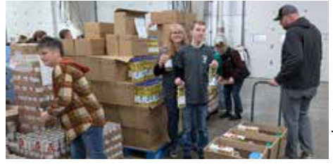
Alexandria Champions Lions helping pack boxes for Jingle Bells.