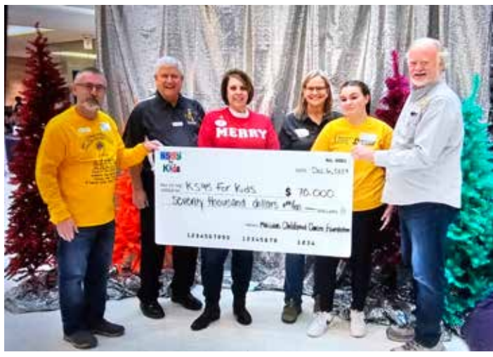
Some 5M MLCCF board members got involved with the KS95 Radiothon at the MALL OF AMERICA on December 6th. Over $1M collected for Cancer research. A few members presented a check for $70k.