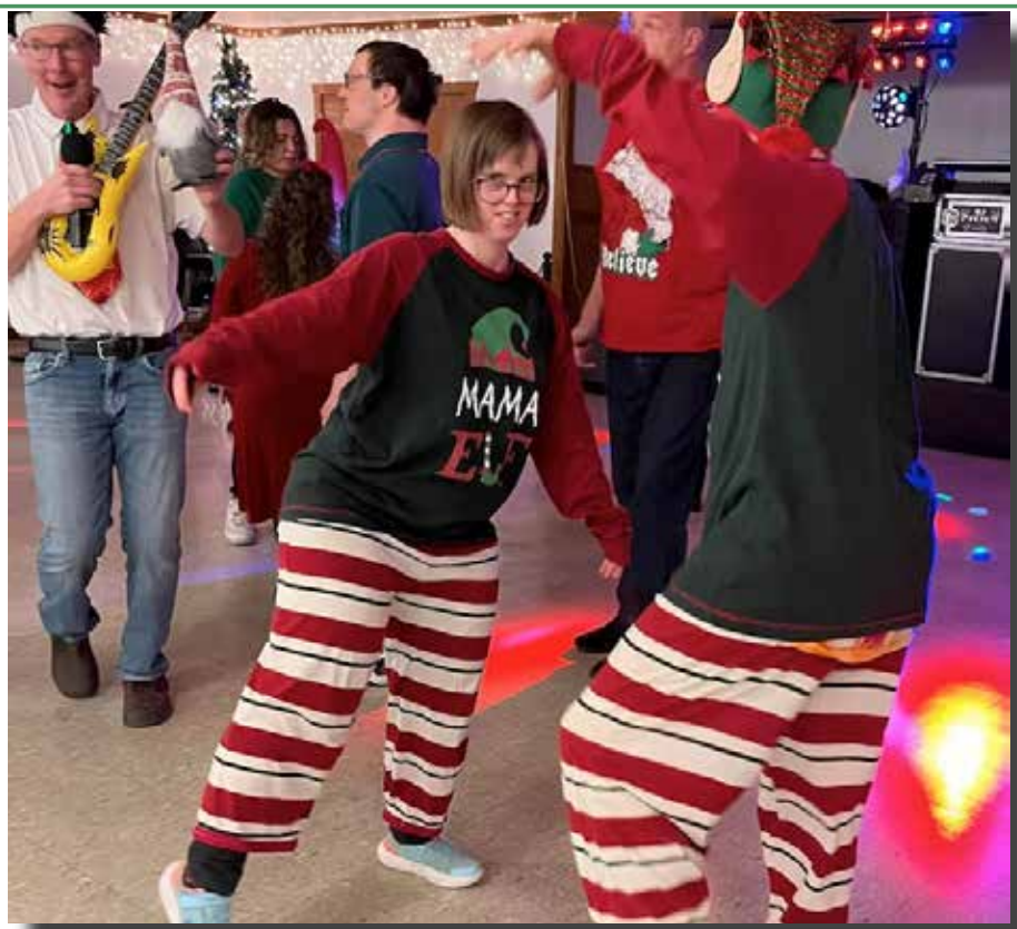
The Sauk River Champions held a very festive Christmas dance! There were over 100 in attendance. Merry Christmas!