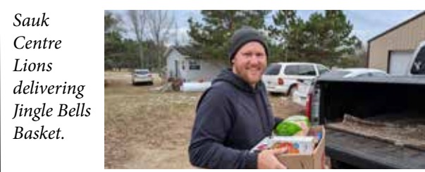
Sauk Centre Lions delivering Jingle Bells Basket.