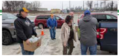
Many Lions helping with Jingle Bells.