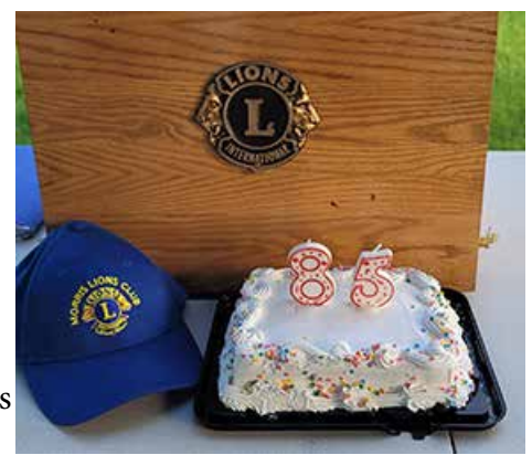
Morris Lions Club celebrates their 85 years as Morris Lions with a steak picnic and cake