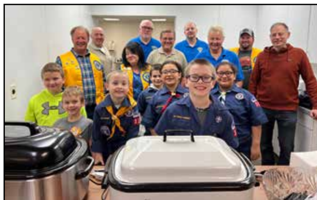
The Elbow Lake Lions and the local Boy Scouts served a French Toast breakfast to benefit the local library.

I hope to see you in Bemidji for the Lions D-Feet Hearing Loss walk on June 4th! If not Bemidji, head to the arboretum in Chaska. Don't worry if you haven't signed up - just show up!