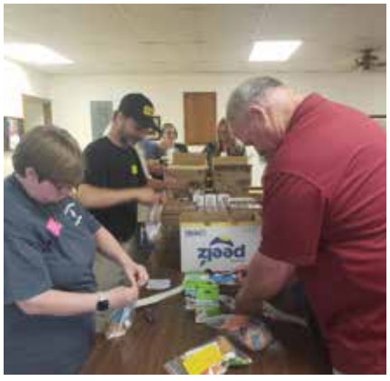
Zone meeting in Evansville