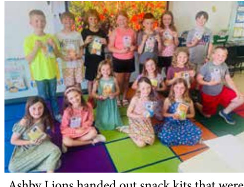
Ashby Lions handed out snack kits that were assembled at the Zone meeting in Evansville.