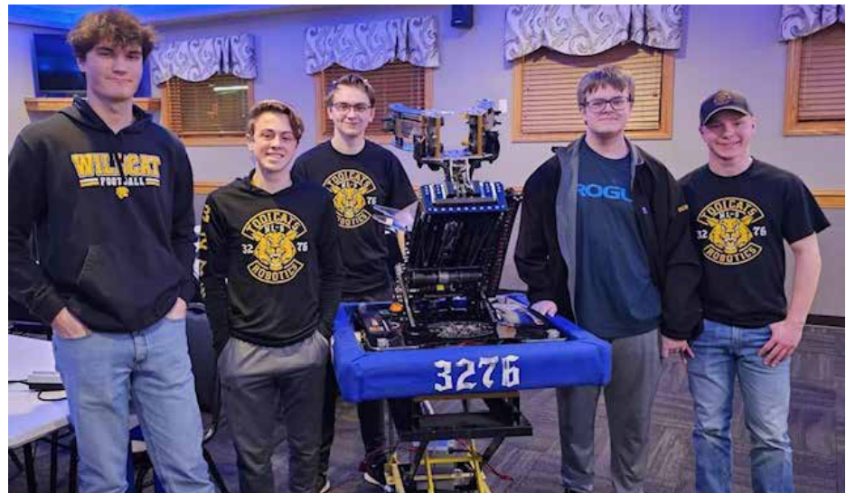
The local high school NLS Toolcats robotics team came to our March meeting and demonstrated their robot. They are heading to competitions including the World at Houston Texas in April.