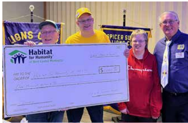
Spicer Sunrise Lions recently donated $1,000 to our local Habitat for Humanity