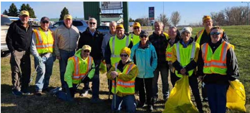
Spicer Lions recent ditch cleaning in Spicer.