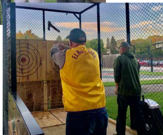
The Elbow Lake Lions added a little axe-throwing fun to their September meeting.