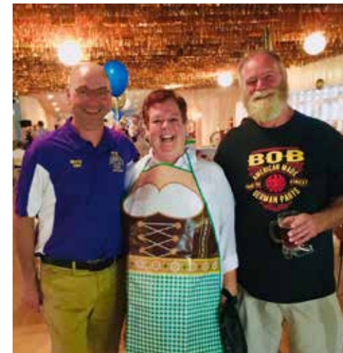
The Barrett Lakeside Pavilion was full of music, dancing, food, games, and fun as the Elbow Lake Lions hosted their first Augtoberfest! It turned out to be a great fundraiser!