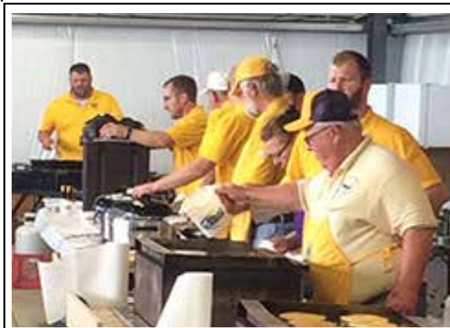
79th Annual Hector Flight Breakfast.