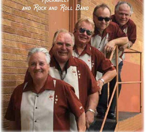
THE UPPER MIDWEST'S PREMIER DOO-WAP, ROCKABILLY AND ROCK AND ROLL BAND