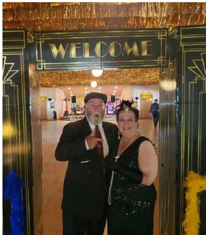
Elbow Lake Lions host "Speakeasy" Fundraising Event!