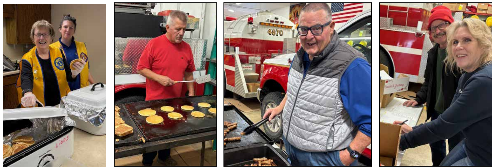
Raymond Lions Breakfast December 6th