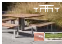
APEX Table Ensemble

Crescent Cove http://crescentcove.org : Crescent Cove wants to install a picnic area that will accommodate handicapped children and their families. Because of the unique design and safety features, this will cost about $15,000. We would propose that the Lions of Minnesota fund this necessary project. The MN Lions Childhood Cancer Foundation will match any contributions by clubs or individuals at the rate of 1.5 to 1. That is, if a gift of $100 is made, the Foundation will match it with another $150. If we can raise $6,000 from clubs and individuals, the Foundation match of $9,000 will reach our goal. (Note Crescent Cove on the memo line of checks.)