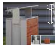
APEX Litter & Recycling Receptacle