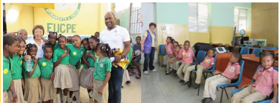
448 CHILDREN IN 3 DIFFERENT SCHOOLS IN THE DOMINICAN REPUBLIC HAD THEIR VISION SCREENED .

14 cataract surgeries performed. NY Cosmopolitan Lions Club paid for one, the John Jay Dudley Luce Foundation paid for another. 800 eyeglasses fitted on Dec 2 - 3, the rest of the eyeglasses donated to the local Lions Clubs. Performed vision screenings on 448 children in 3 different schools. Donated a wheelchair to the Club de Leones Romana Centro for them to lend to whoever needs it in the community. Donated $700 to a needy family to fix the roof of their house in Santo Domingo. Well done!!!