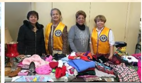
NY Metropolitan LC Garage Sale