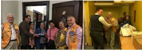
BORINQUEN LIONS PRESENTED A DONATION OF FOOD, CLOTHES AND $200.00 CASH TO THE ASCENSION CHURCH HOME HEALTH SERVICES FOR THE HOMELESS.