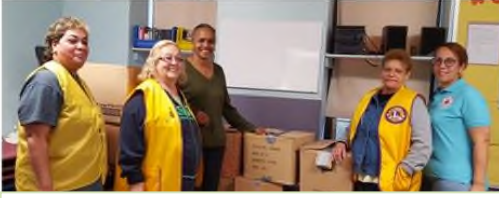
NY EAGLE LIONS - DONATION OF 10 BOXES OF NEW CLOTHING ITEMS AND BLANKETS TO A WOMEN'S SHELTER IN THE BRONX