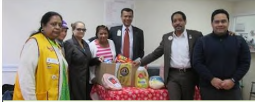
ASIAN AMERICAN LIONS PREPARED FOOD PACKAGES FOR NEEDY FAMILIES DURING THANKSGIVING