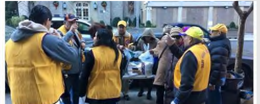
NY HIGHBRIDGE LIONS - FOOD FOR THE HOMELESS AT FT. WASHINGTON ARMORY MEN'S SHELTER