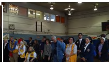
NY TAINO THANKSGIVING CEREMONY HONORING THE VETERANS.