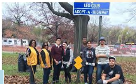
NY IMPACTO LIONS AND LEOS - ADOPT-A-HIGHWAY CLEANING PROJECT.