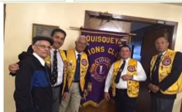
QUISQUEYA LIONS - ANNUAL THANKSGIVING TURKEYS AND FOOD BASKETS TO NEEDY FAMILIES.