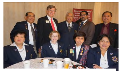
STATEN ISLAND LIONS