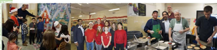
TUCKAHOE EASTCHESTER LIONS AND LEOS - ANNUAL CHILDREN WITH SANTA- TOYS AND GIFTS FOR CHILDREN AND PANCAKE FUNDRAISER