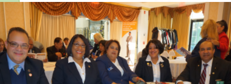
WASHINGTON HEIGHTS & IMPACTO LIONS