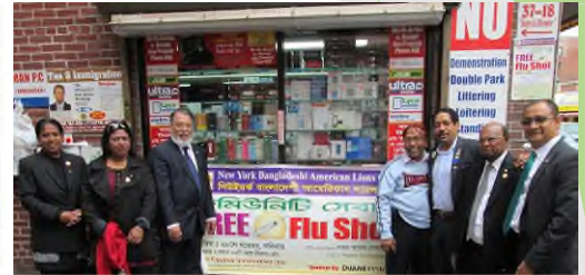
BANGLADESHI AMERICAN LIONS FREE FLU SHOTS INITIATIVE