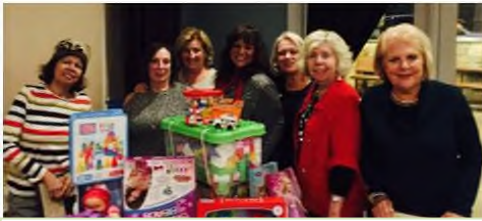
Anne Sullivan Lions Toy Drive - The toys were donated to the Salvation Army