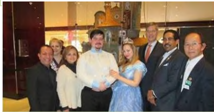
NY GLOBAL LEADERS LIONS - DOLL HOUSE EXHIBIT FUNDRAISER.