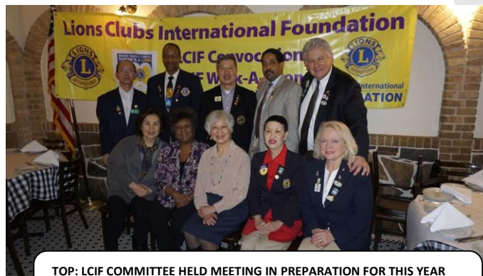
TOP: LCIF COMMITTEE HELD MEETING IN PREPARATION FOR THIS YEAR LCIF CONVOCATION AND WALKATHON.