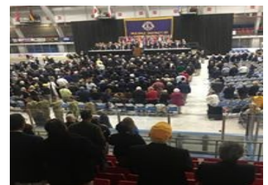
At the Convention Center for the opening ceremony.