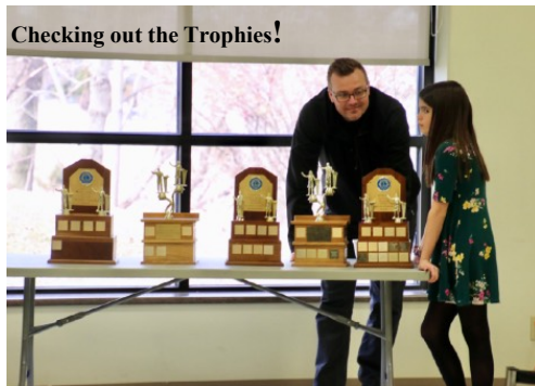
Checking out the Trophies!