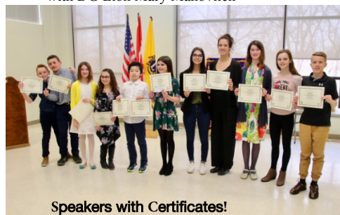
Speakers with Certificates!