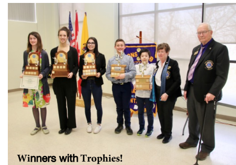
Winners with Trophies!