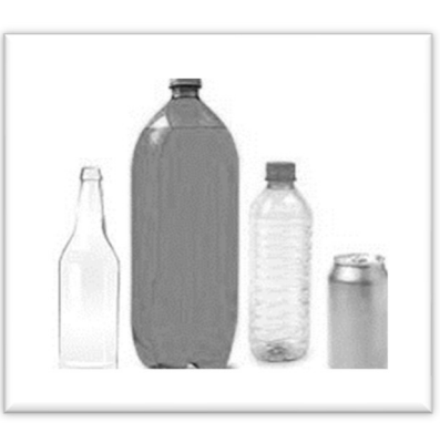
We are requesting your empty pop cans, Beer cans or bottles and Liquor bottles to help with the fund raiser.