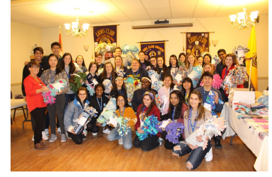
Above: Attendees from 2019 Retreat made blankets for Ronald McDonald House Families to take home.

Attendees are given the opportunity to complete a meaningful service project together.