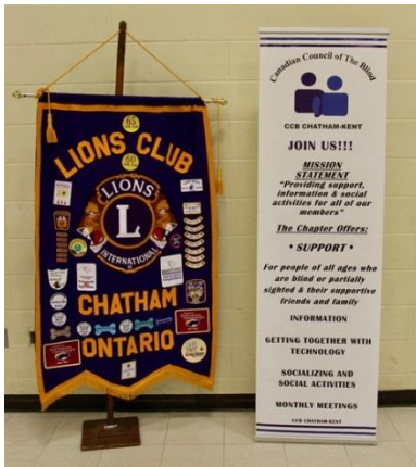
The Chatham Lions celebrated Christmas!