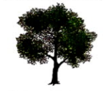
A Living Memorial