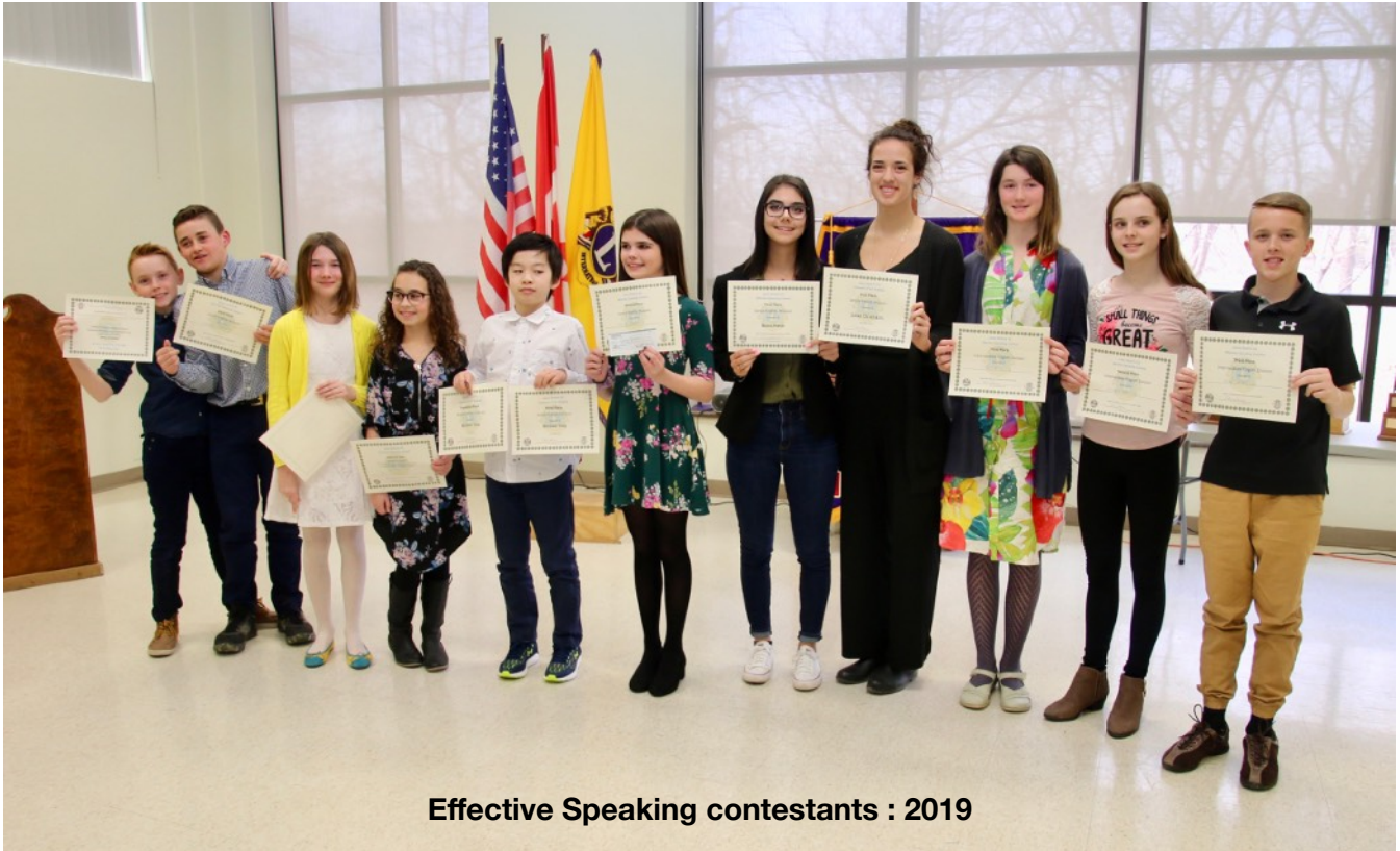
Effective Speaking contestants : 2019