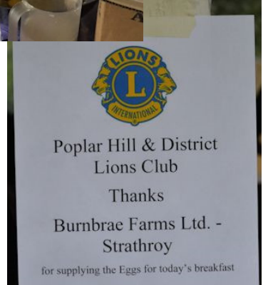
Right: The notice thanking Burnbrae Farms Ltd in Strathroy from where we were given the eggs. Not our only business donor but today, quite an important one!