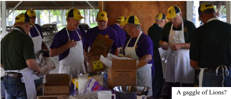
A gaggle of Lions?