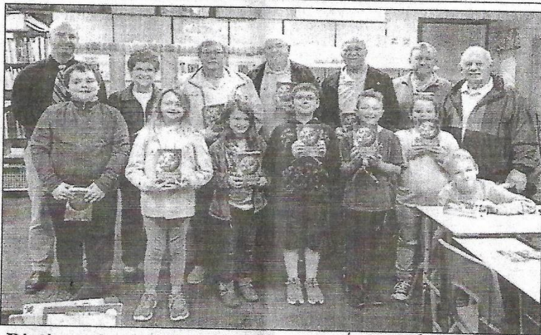
THE DAILY CLINTONIAN, CLINTON, INDIANA