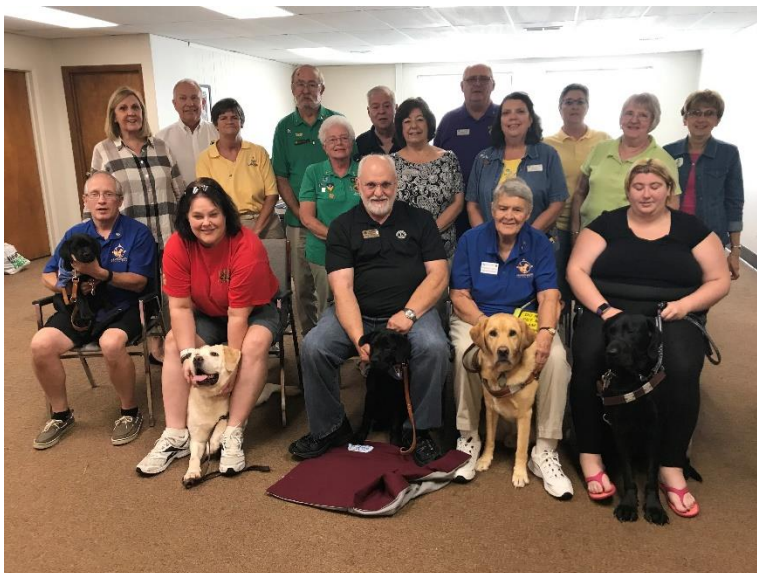
Indiana Leader Dog Trustees and Associates met at the State Building. Working Leader Dogs and learning puppies always make the meeting have a little more meaning.