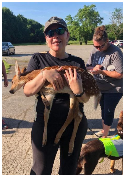
During a Lafayette Lions Club Saturday Parkrun event, a lone fawn was found alongside a running path. It was rescued by two runners (vets) and taken to a rescue shelter. It has survived and thrived. So this was a diabetes, opioid prevention and “environmental” event for the club! Way to go!