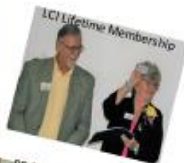
Lion Lifetime Membership