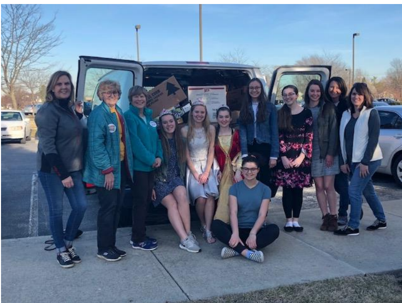
Girl Scouts, High School Troop #4487, joined up with the Zionsville Food Pantry and the Zionsville Lions Club to box up the 3,000 food items collected by 120 Girl Scouts.