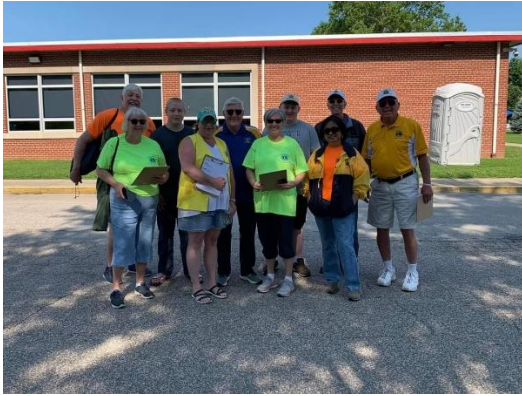
Martinsville Noon Lions helped marshal the local 4th of July Parade. Thank you, Lions, for helping with such a large job!