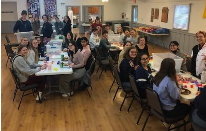
Zionsville Leo's meet to start stuffing some of the 22,000 eggs for the Egg-normous Egg Hunt in Lions Park on April 16 th !