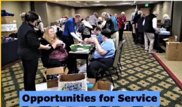
Opportunities for Service

Mark your calendar now for the 2024 Mid-Winter Conference.