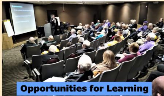
Opportunities for Learning

It's not too early to start planning for 2024.