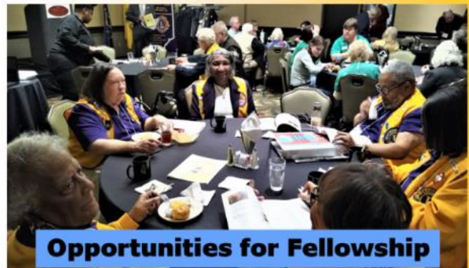
Opportunities for Fellowship

Crowne Plaza Indianapolis Airport January 19-20, 2024