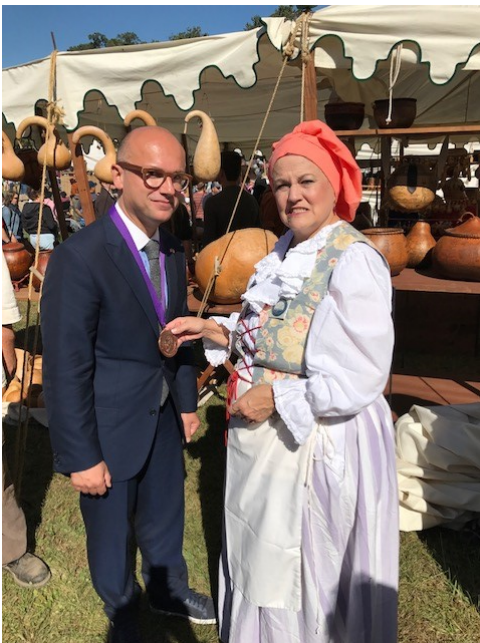
DG Chloe presenting Consul General Lacroix with the Feast of the Hunters Moon 50 th Anniversary Medallion.