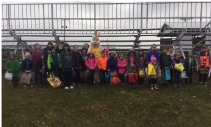
Lots of smiling faces at the Oxford Lions Club's annual Breakfast with the Easter Bunny and Egg Hunt on Saturday March 31, 2018. This event is for the community and all free will donations went to the Oxford Food Co-op.