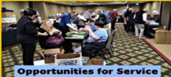
Opportunities for Service

Mark your calendar now for the 2026 Mid-Winter Conference.