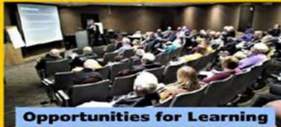
Opportunities for Learning

It's not too early to start planning for 2026.