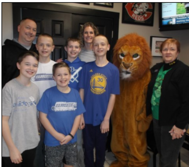
5th and 6th grade coaches and team members of the Batesville Lions Club Basketball Team at the celebration of their age bracket championship.