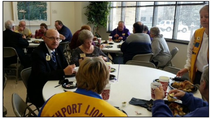
District 25-F Lions enjoying lunch during the Convention.