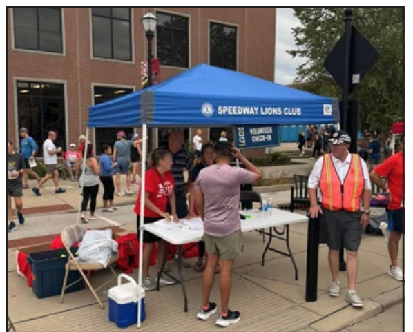
Photo provided Speedway Lions volunteered with the 317 Run, a series of running events held throughout central Indiana.