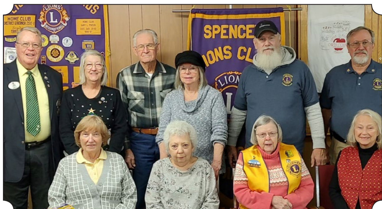
Hello, Spencer Lions!