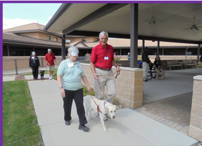
VDG Isabel is blindfolded and walking with a Leader Dog.