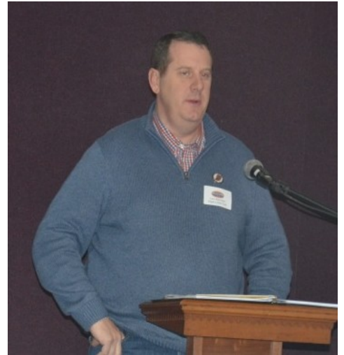
New District G Leadership for 2015-2016 Elected