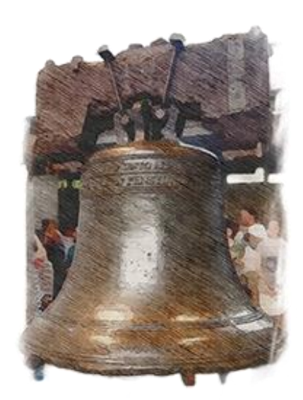
Proclaim liberty throughout all the land unto all the inhabitants thereof.