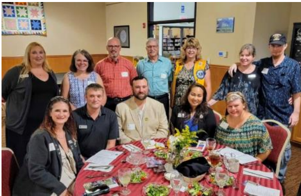
Middlebury Lions Club members at Banner Night