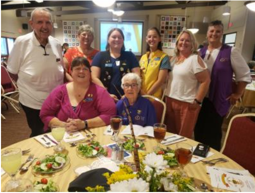
Culver Lions Club members at Banner Night