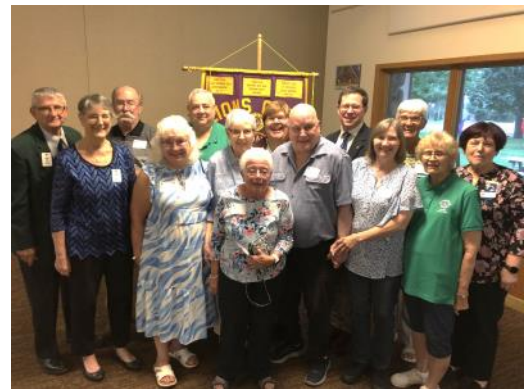
Dunlap Lions Club members at Banner Night