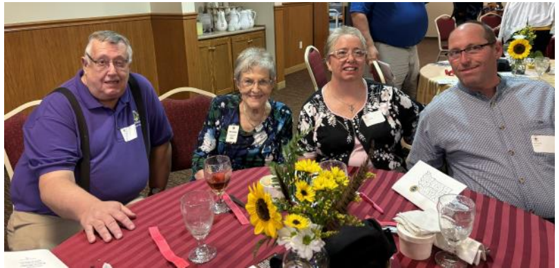
Syracuse Lions Club members at Banner Night