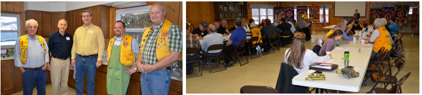
Left Picture. Thanks to New Paris Lions who cooked and served a wonderful breakfast. Pictured Right. Li-