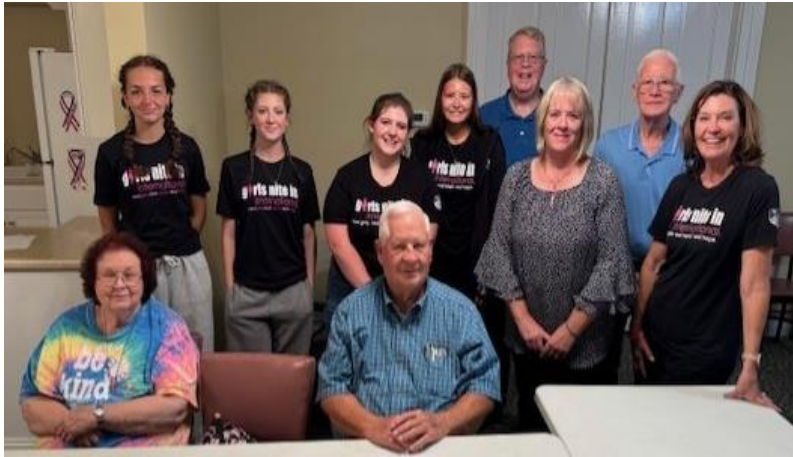
The Jamestown community Lions Club partnered with the Girls Nite In group to fill Halloween bags for the town Halloween Party.