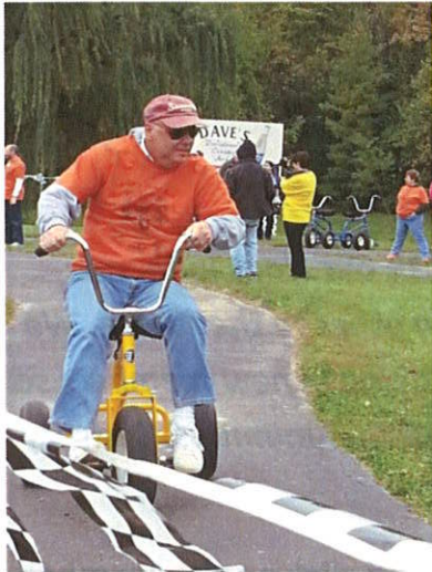
Fishers Lions Participate in the Brian's Tricke Race at the Indiana School for the Blind