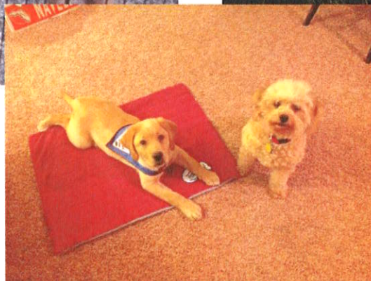
Clockwise from left: The "Fab Four" at Leader Dog. FLD Bella is puppy on the right (the cute one!). FLD Bella at Lake Fannie Hooe in Copper Harbor, Michigan. Bottom picture is FLD Bella and Lil Ann after a good training session, still looking for treats!