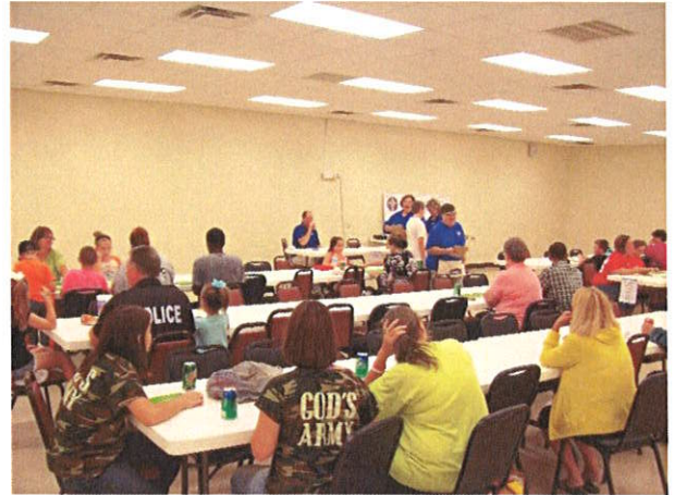
Left Photo: Chandler Lions Club Float & Parade Right Photo: Chandler Lions Club conducting their regular meeting