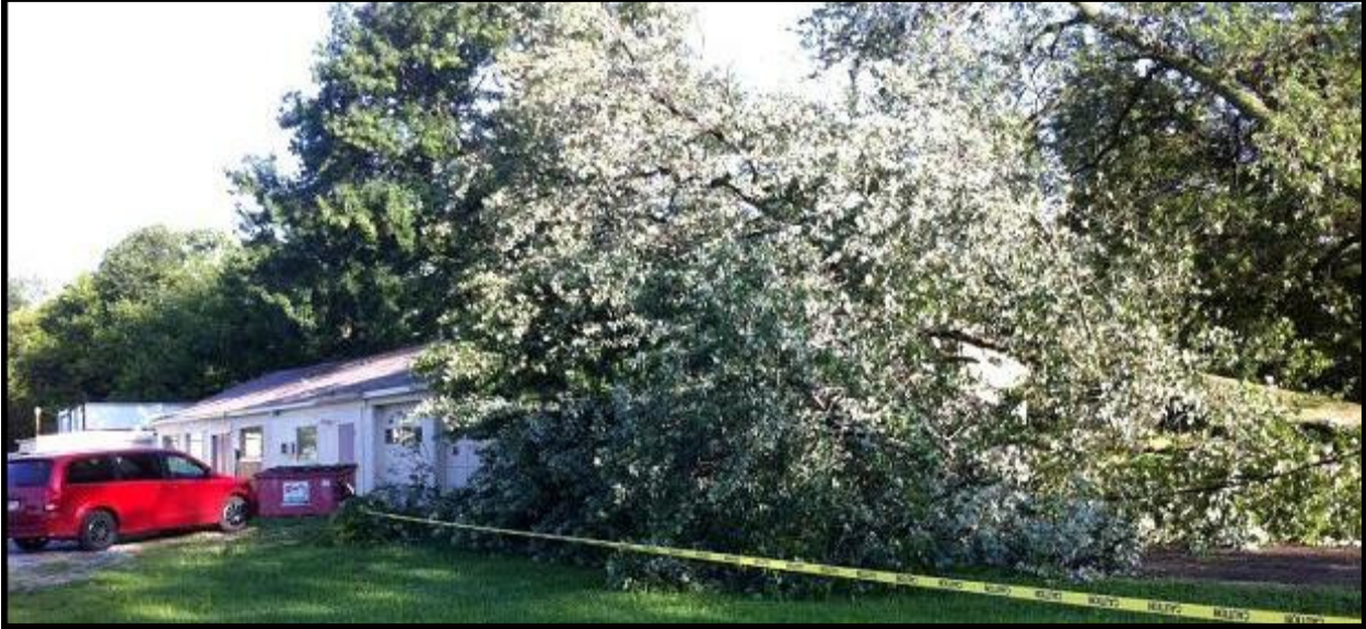
Chapel Hill Lions clubhouse damage during storms last week. Minor damage to building roof and power lines taken down. Repairs are under way.