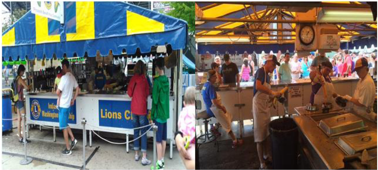
Indy Washington Corn Stand at Indiana State Fair