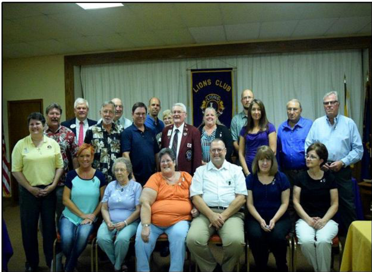
North Vernon Lions Club Charter Night!