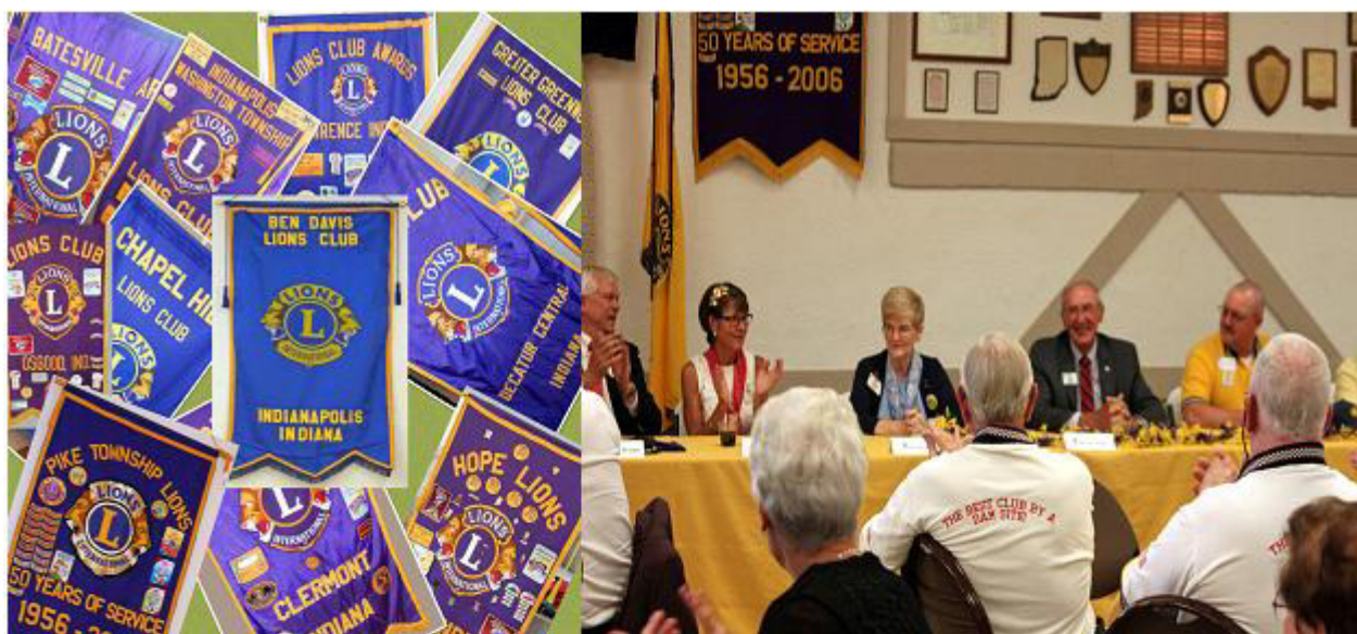
Banner Night 2015