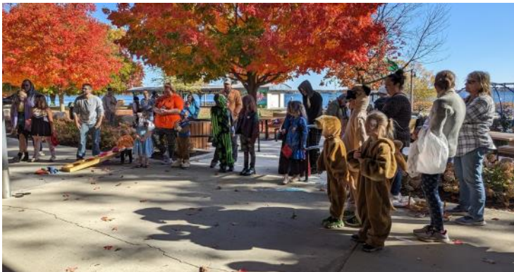
Left: Participants at the Culver Lions Club community Halloween Party.

The Culver Lions Club held their 70th(?) annual community Halloween Party at the Culver Depot on Saturday, October 26th.