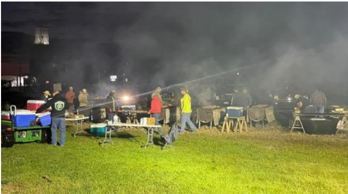
Getting an early start at the pork chop sale.