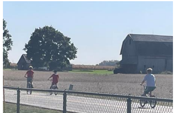
Madison Township Elementary School students participate in the annual Bike-A-Thon to raise funds for the Kids Caring and Sharing program for Riley Children's Hospital.