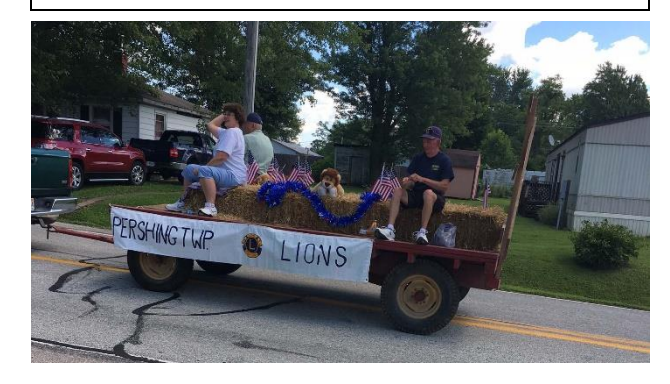
Pershing Township Lions Club float entry into the July 4^{\mbox{th}} Freetown Festival