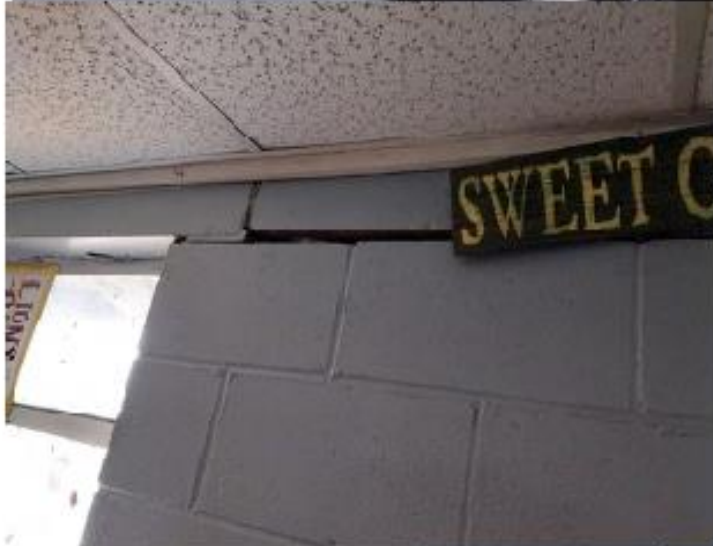
Various pictures of the damage to the Oakland City Lions Club House. The roof was lifted up and slammed down cracking the block wall.