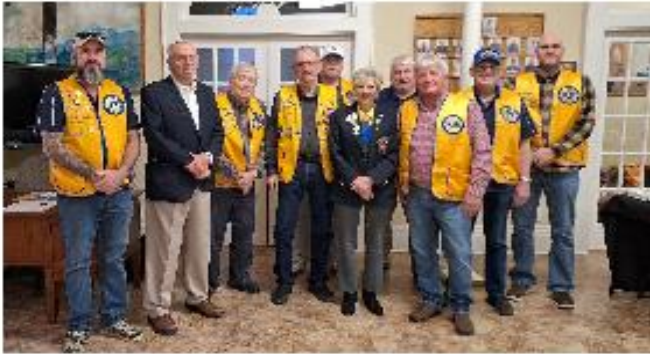
Vevay Lions Club