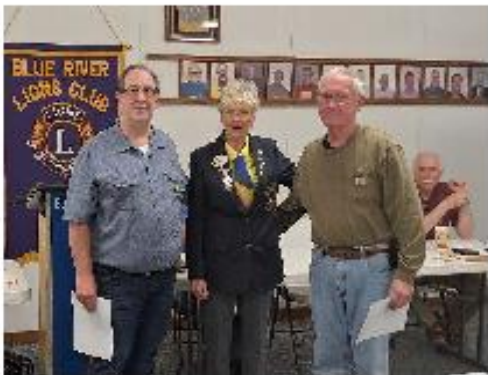
Blue River Lions Club