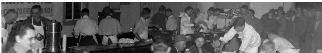
1949 Mishawaka Lions Club Pancake Breakfast