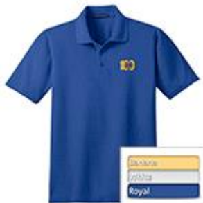
Mens Centennial Polo Small - 4X US$36.00 - US$41.15