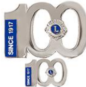
Centennial Pin - Silver 1" US$10.95 Centennial Pin - Silver 1/2" US$5.95