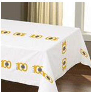
Centennial Table Cover 54" wide x 108" long US$4.45