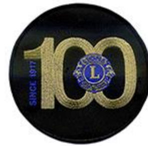
Deluxe Centennial Patch 5" logo patch US$8.05