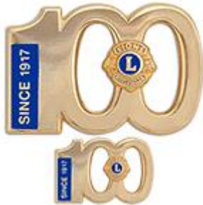
Centennial Pin - Gold 1" US$10.95 Centennial Pin - Gold 1/2" US$5.95