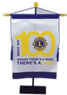
Centennial Banner 7" x 9" US$10.45