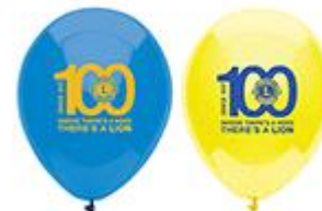
Centennial Latex Balloons 9" Balloons - 100/pack US$15.15 per Pack

Visit our online Lions Store to order these and other fine Lions products. In addition to our online selection of products you can also shop directly through our Official Licensees for many other Lions products.