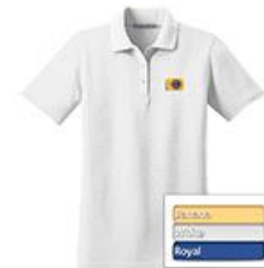
Womens Centennial Polo Small - 4X US$36.00 - US$41.15