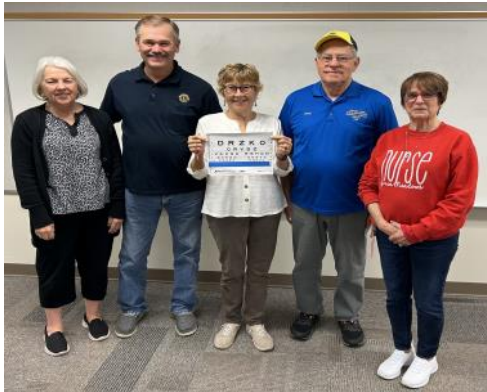
FRANKFORT LIONS recently checked the eyes of 275 third and fifth graders at Green Meadows school.