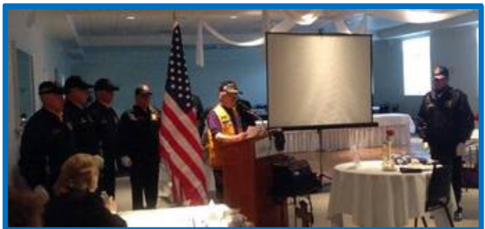
PLAN NOW TO ATTEND THE NEXT DISTRICT CONVENTION