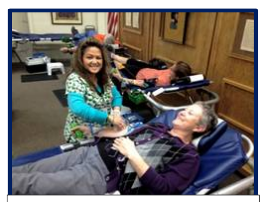
Union City Lions had 40 pints of blood donated at the blood drive they sponsored.