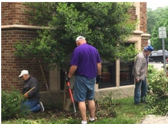
Roanoke Lions working ISBVI