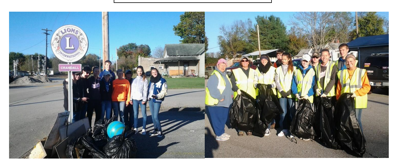
The Crandall Lions and their community helping to clean up their environment!