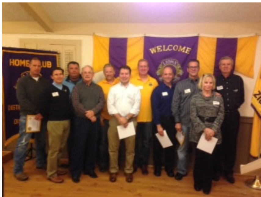
Zionsville Lions Club's new members! Great recruiting