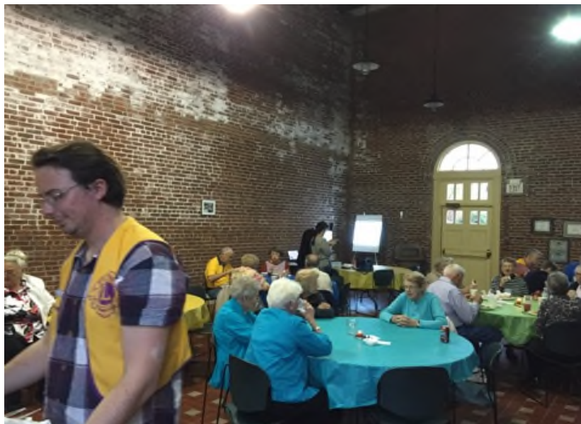
Many patrons enjoyed the Plainfield Lions Club Spaghetti Supper. Mangiare a sazieta!