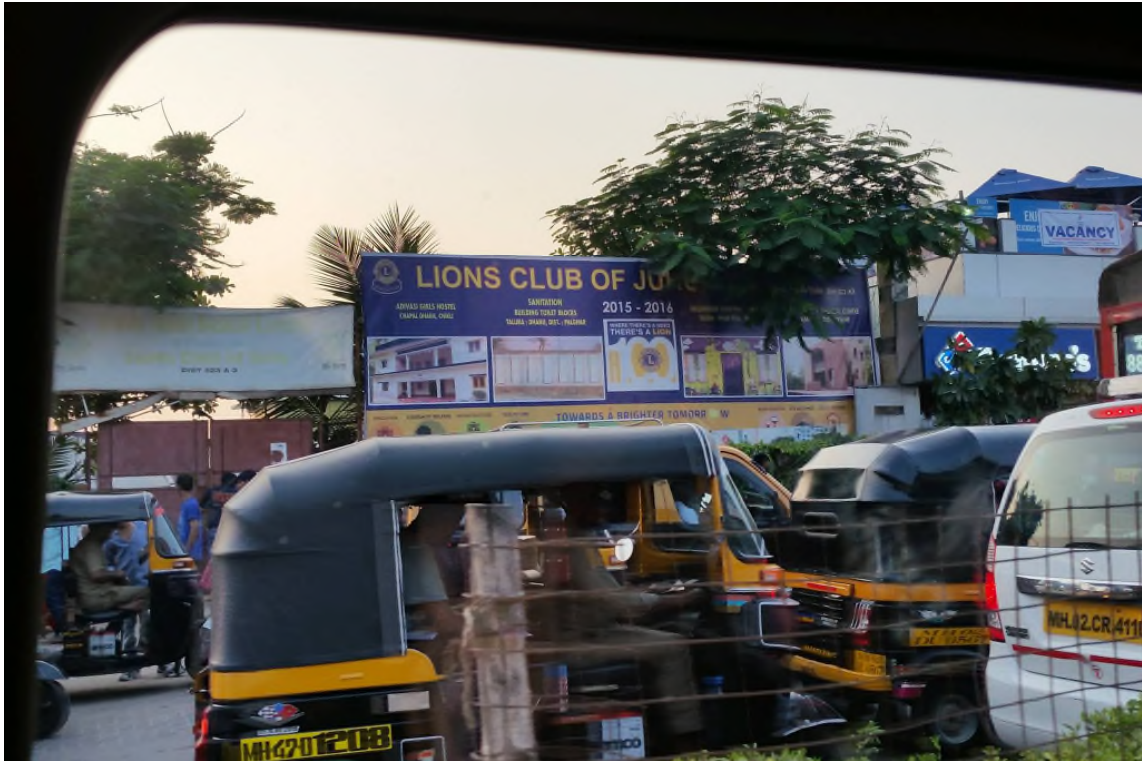
Zionsville Lion Burke LaShell snapped this photo in Juhu, a suburb of Mumbai. See? We are all worldwide!