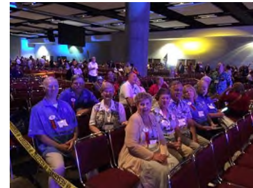
Relaxed and ready for a great year!