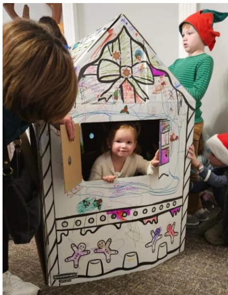
Coloring the Elf Clubhouse

Thanks to the club members who volunteered their time, making this a fun event!